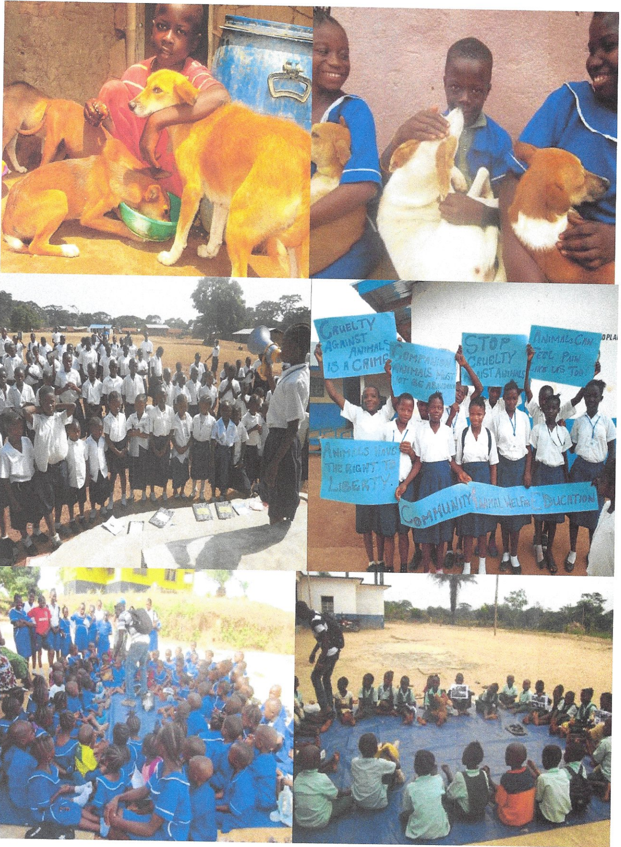
Motto: Working Together for a Better Future for Animals and Humans